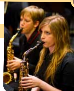
Members of QYO Wind Ensemble

The QYO Finale concert showcases seven QYO orchestras featuring 470 musicians aged 9 to 24: Queensland Youth Symphony, 2 nd and 3 rd Queensland Youth Orchestras, Wind Symphony, Wind Ensemble, Big Band and Junior String Ensemble.