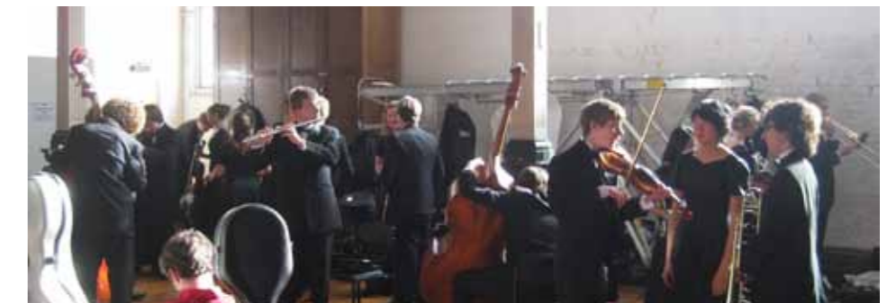
Members of the Colorado Springs Youth Symphony practice before their joint concert with QYS in 2010