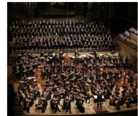
The Gothic Symphony performance at QPAC.