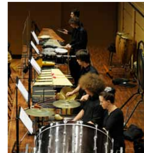
QYO Wind Ensemble percussionists at the 2010 QYO Finale Concert.